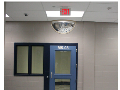
▶ Dayrooms and Visitation Areas