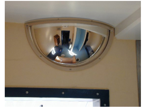
▶ Cell Observation