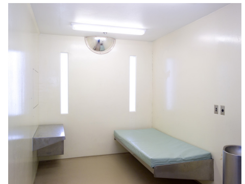
▶ Safe Inmate Inspection